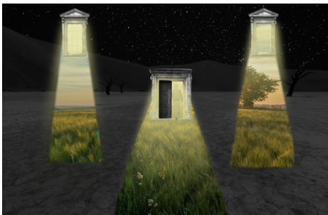
Madelyn Lazzara, Grade 11 "Natural Beauty" Photography Honorable Mention